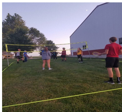
Youth Group back in action!

He will be speaking on the spiritual message of our Stained Glass Windows.